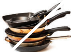
POTS, PANS, SCRAP METAL