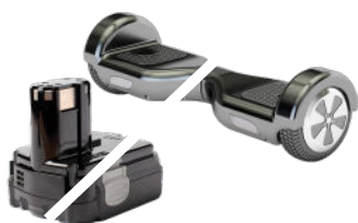
BATTERIES OR BATTERY- CONTAINING DEVICES INCLUDING LITHIUM ION