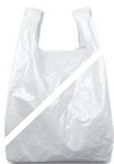
PLASTIC BAGS & BAGGED MATERIALS